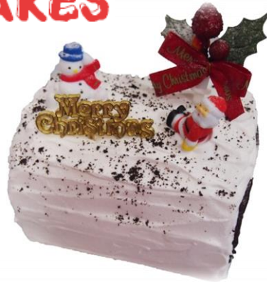
Black forest Log cake

Soft cocoa sponge with Belgium dark chocolate ganache & cream Choice of fillings: Strawberry/Blueberry/Valrhona crunchy pearls