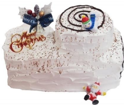
The Vanilla Log cake

Soft cocoa sponge with Belgium dark chocolate cream, black cherries fillings, fresh whipped cream