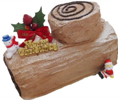
Double Chocolate Log cake

Soft cocoa sponge with Belgium dark chocolate ganache & cream Choice of fillings: Strawberry/Blueberry/Valrhona crunchy pearls